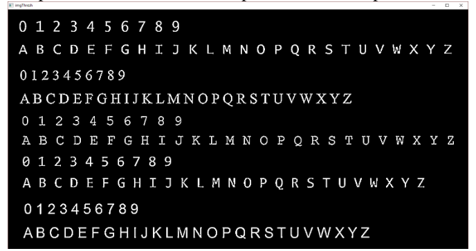
Figure 1. Generated Threshold Image

In this stage the raw image is taken and first it is converted to gray scale image after that it is converted into binary image this operation is called as thresholding. This process of image transformation is called as Image Digitization. Now to reduce the noise from image various techniques like morphological operations are used to connect unconnected pixels, to remove isolated pixels, to smooth pixels boundary.