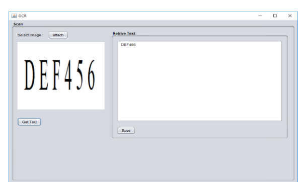
Figure 5. Screeshot of Implemented OCR Application

The workflow of implemented example for the Integrating text mining with Image Processing is shown in Fig 4. For now the project is at the beginning stage so far we have completed with the first stage that is OCR which we have developed in Python which then has to be integrated with text mining.